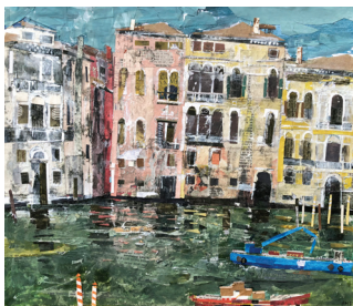
Andrew McDowall Grand Canal mixed media on board 11¾ x 13½ ins