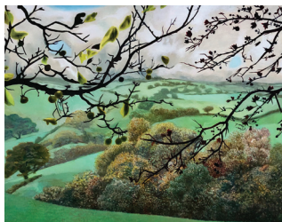
Sara Philpott View from the Driveway oil on board 20 x 22 ins