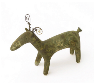
Claire Ireland Vanadium Horse hand built stoneware 5 ¼ x 6 ins