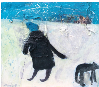
Elaine Turnbull Snowy Walk oil & acrylic on board 9 x 10 ins