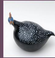
Caroline Grant Guinea Fowl earthenware 12 x 13 x 9 ins