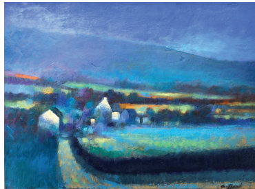
Charlie Baird Evening Farm oil on board 12 ½ x 17 ¼ ins