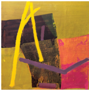
Liz Hough Yellow Trees mixed media on board 23 ½ x 23 ½ in