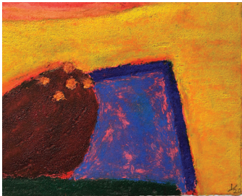
Ursula Leach Enclosed ed. 20 carborundum 5 ¼ x 6 ½ ins