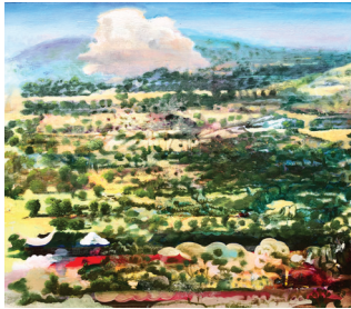
Sara Philpott Harvest Lands oil on board 16 ½ x 18 ¾ ins