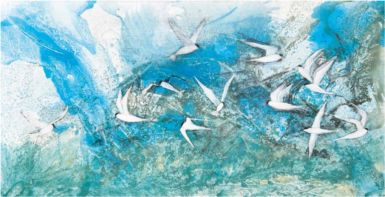
Roseate Terns in Flight acrylic on canvas 33 ½ x 65 in / 85 x 165 cm