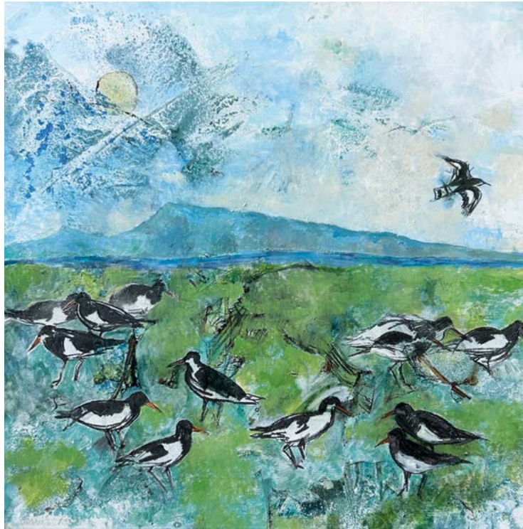
Oyster Catcher acrylic on canvas 35 ½ x 35 ½ in / 90 x 90 cm