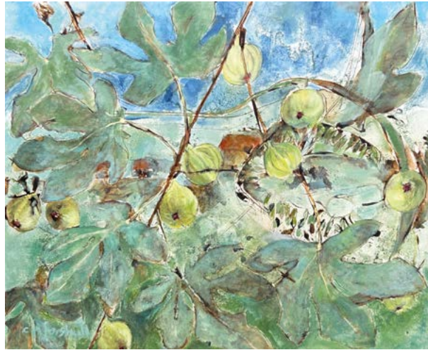
Paysage Lotois acrylic on canvas 21 ¼ x 25 ½ in / 54 x 65 cm