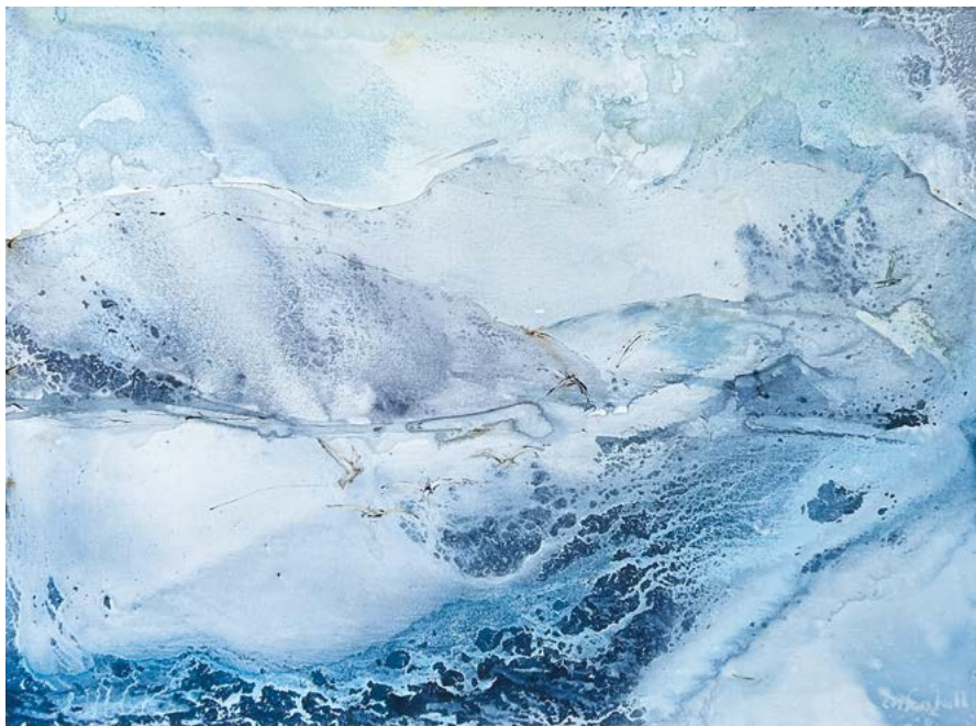
Northern Seascape II mixed media on canvas 33 ½ x 45 ¼ in / 85 x 115 cm