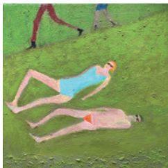
Michael Rees Indian Summer mixed media on canvas 20 x 20 cm