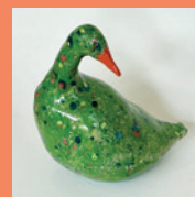
Caroline Grant Green Goose earthenware 30.5 x 29 cm