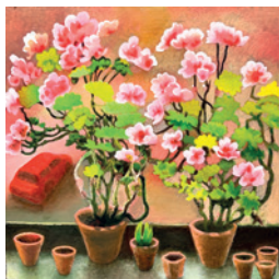
Sara Philpott Red Car & Gerania oil on board 30.5 x 30.5 cm