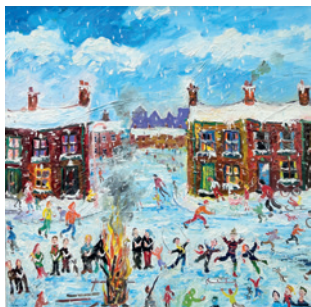
Simeon Stafford The Choral Singers oil on canvas 81 x 81 cm