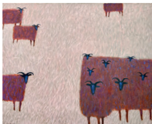
Charlie Baird Black Sheep oil on canvas 60.5 x 76 cm