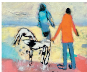
Elaine Turnbull Walking Spotty Dogs II oil & acrylic on canvas 25.5 x 30 cm