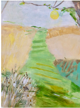
Jacqueline Hall Happy Day oil on canvas 122 x 91.5 cm