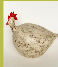
Caroline Grant Large Speckled Chicken earthenware 32 x 38 x 23 cm