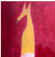
Michael Rees Soulmate oil & mixed media on canvas 20 x 20 cm