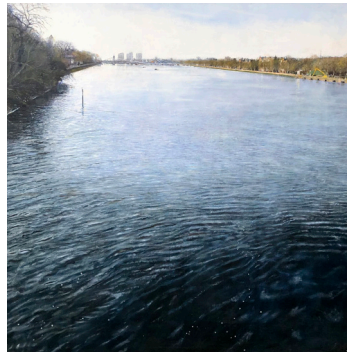
Andrew Torr View from Chelsea Bridge oil on canvas 100 x 100 cm