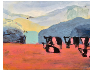
Elaine Turnbull Sheltering from the Wind oil on canvas 45 x 60 cm