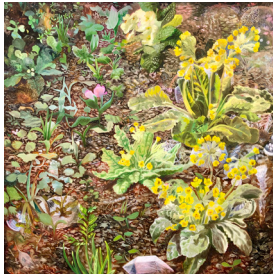
Sara Philpott Oxlips, Cowlips & Primroses oil on board 61 x 61 cm